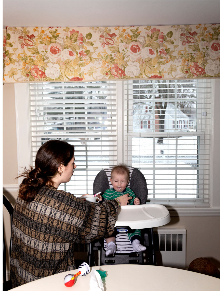
BREAKFAST WITH AUNTIE Foxboro, MA, 2022