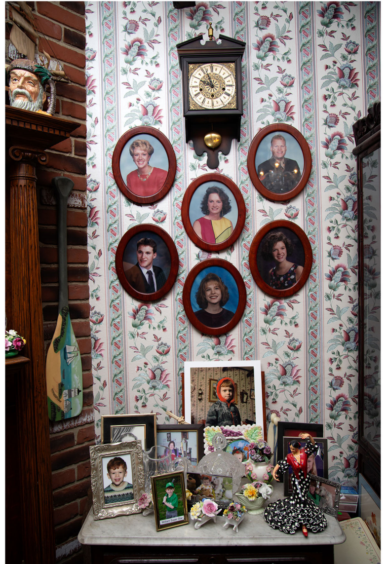
REE'S FAMILY West Roxbury, MA, 2020