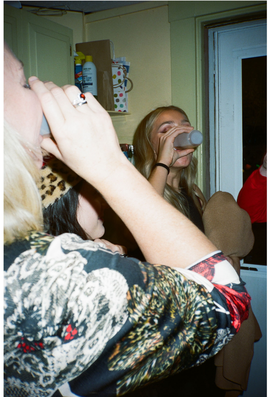
ROBIN'S FIREBALL West Roxbury, MA, 2021