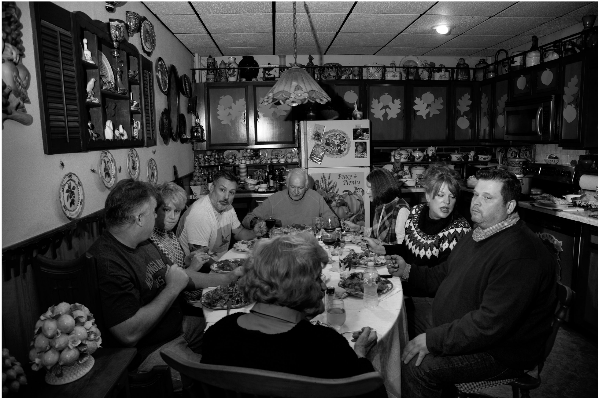
OUR CROWDED TABLE West Roxbury, MA, 2020