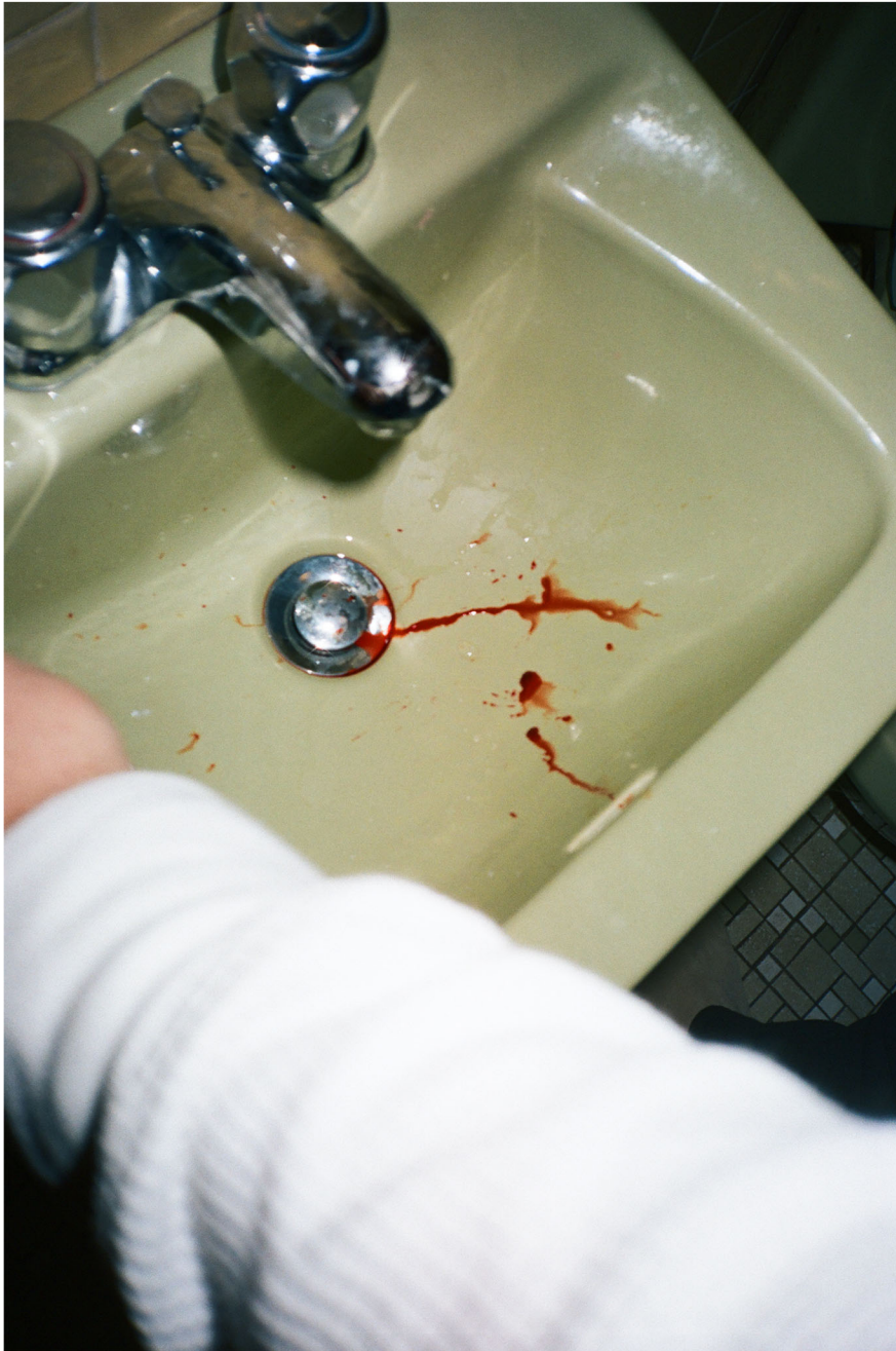
FOR WHAT REASON? West Roxbury, MA, 2021