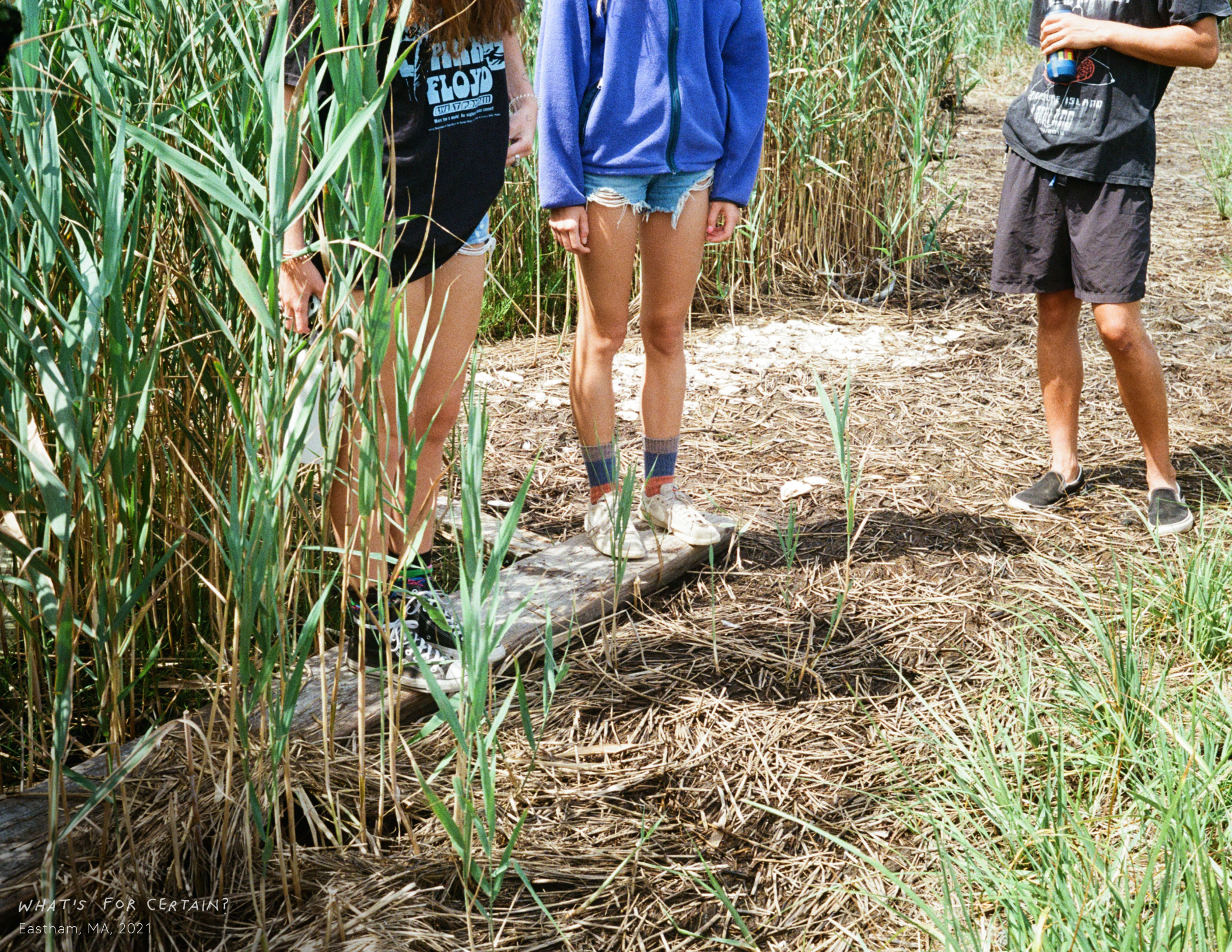
WHAT'S FOR CERTAIN? Eastham, MA, 2021