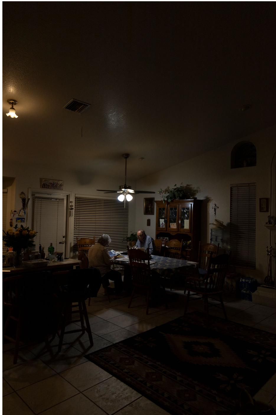
5 AM -READ THE PAPER Chandler, AZ, 2020